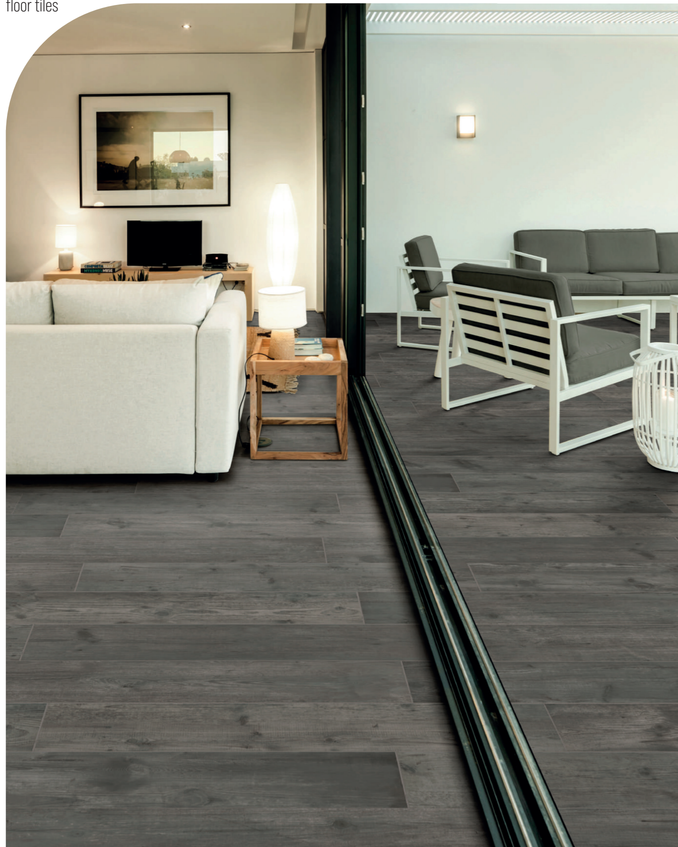
WOOD ARTS PERLA 20x120 | PERLA 20x120 GRIP