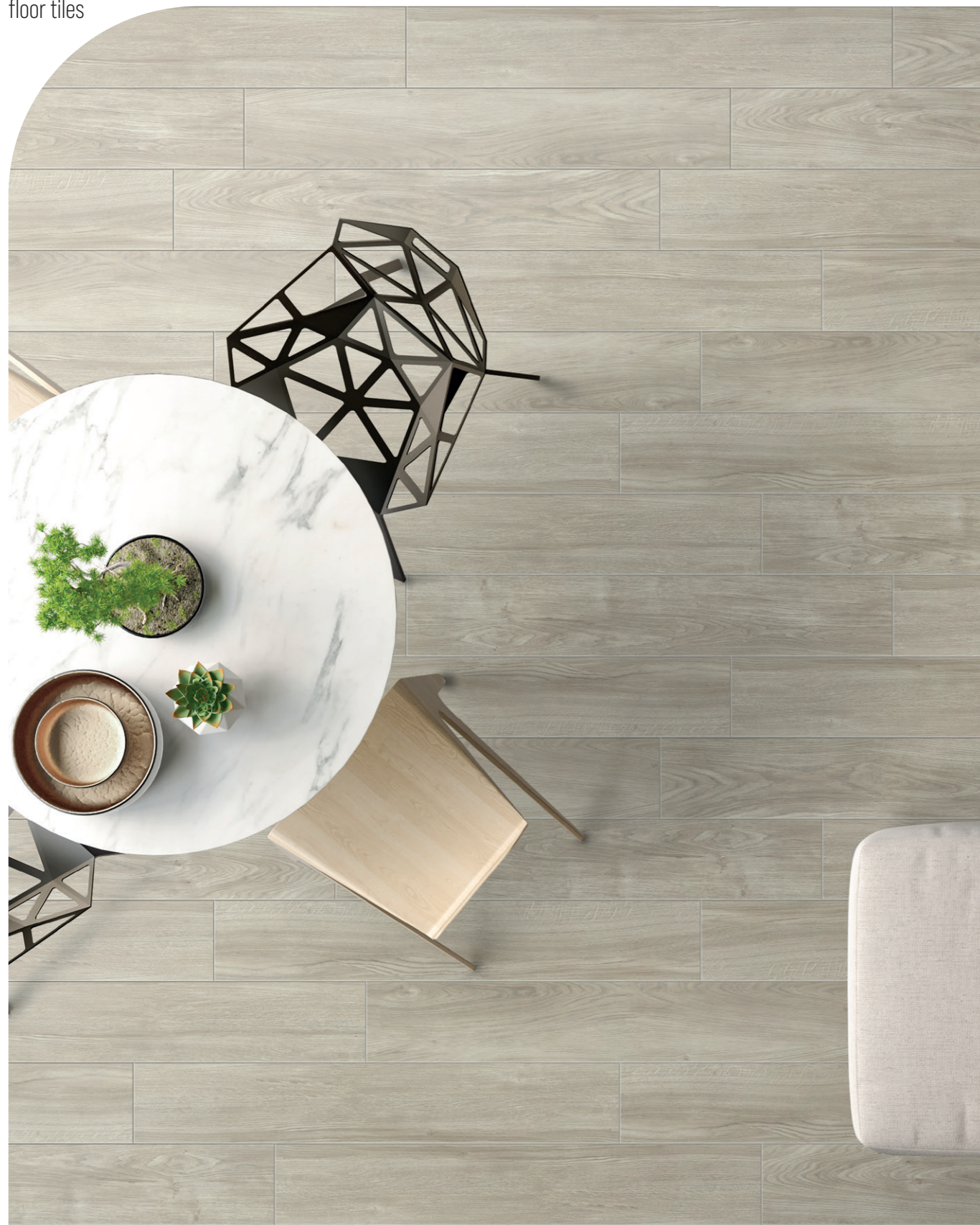
NORWAY SBIANCATO 20,2x122,2